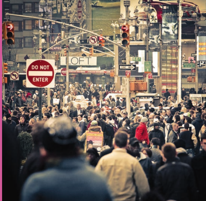
Street in New York, USA