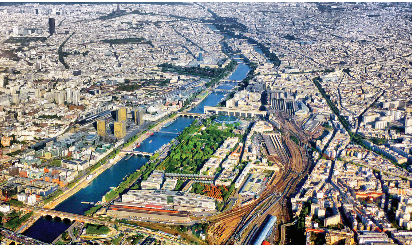
Aerial view of Paris, France