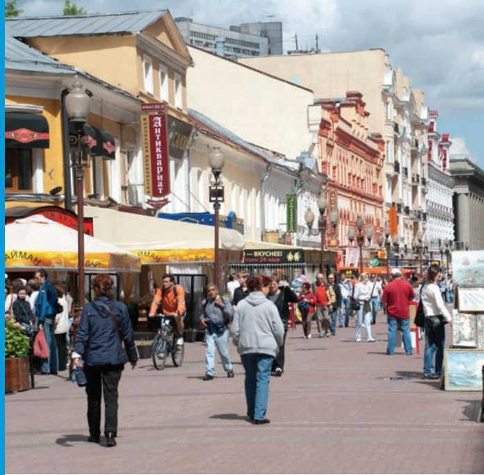
Pedestrian street in Moscow, Russia