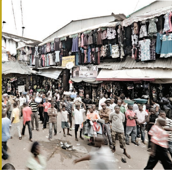
Market place at Onitsha, Nigeria