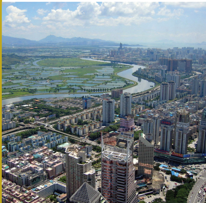
Aerial view of Shenzhen, China