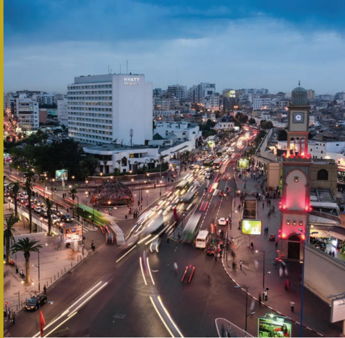
Place of United Nations in Casablanca, Morocco