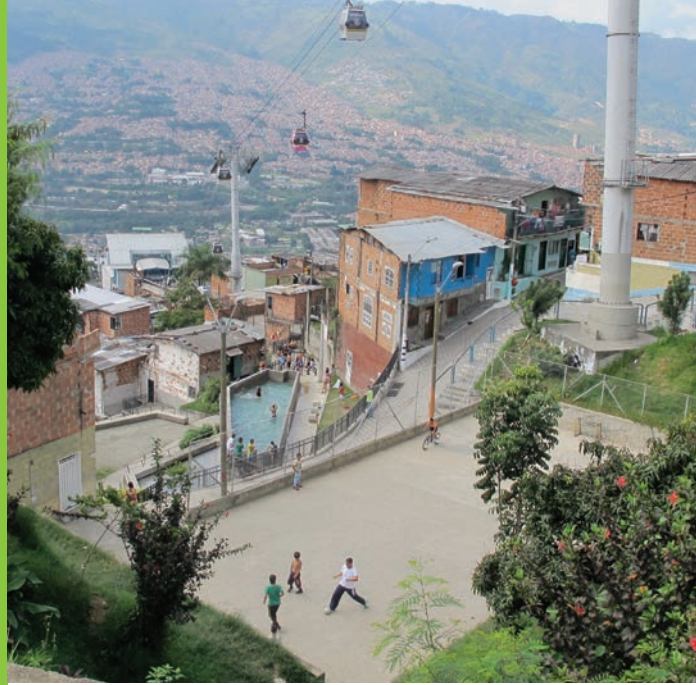
Public space in Medellín, Colombia