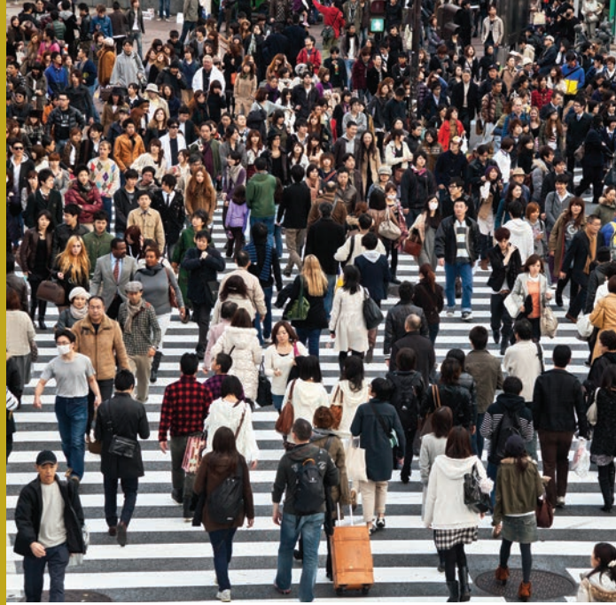
Pedestrians in Tokyo, Japan

Urban and territorial planning can contribute to sustainable development in various ways. It should be closely associated with the three complementary dimensions of sustainable development: social development and inclusion, sustained economic growth and environmental protection and management.